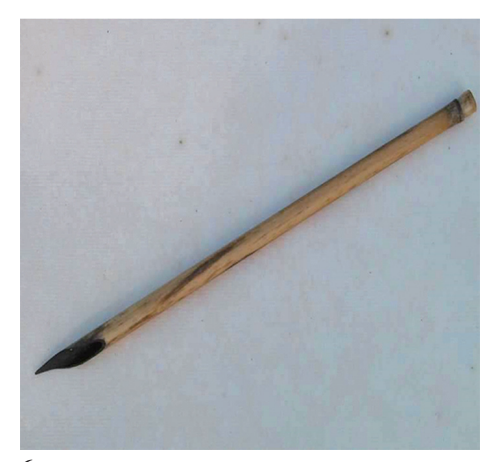
Figure 6 Reed Pen