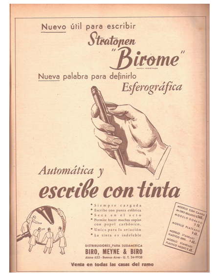
Figure 8 Biro Pen

Note. Retrieved from: http://www.123rf.com/photo_11575070_ doodle-style-feather-quill-pen-and-ink-well-illustration-in-vectorformat.html