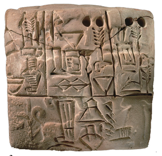
Figure 3 Mesopotamian Clay Tablets Note. Retrieved from http://www.uncp.edu/home/acurtis/Courses/ ResourcesForCourses/Writing/WritingHistory.html