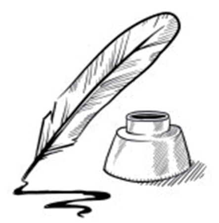
Figure 7 Quill Pen and Ink

Note. Retrieved from http://scriptorium.english.cam.ac.uk/ handwriting/history/intro/reed.jpg