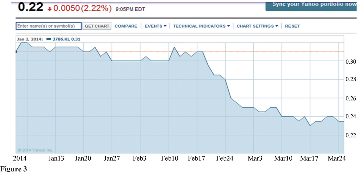
Share Price of MAS

will cancel their travel to MALAYSIAN (as we know travel income is important part of Malaysian). If without the help of government MAS will bank craft. Cause this accident; the insurance will pay million and million cash for it, that's also a big influence on insurance company. In some way the insurance companies also stay in a poor situation. It's like a butterfly effect.