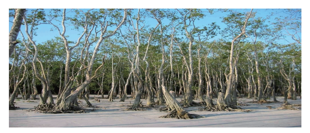
Figure 3 Sundarbans -- World's Biggest Mangrove Forest

Sundarbans is located about 320 km. south-west of Dhaka and spread over an area of about 60000 sq, km of deltaic swamps along the coastal belt of Khulna, the Sundarbans is the world's biggest mangrove forest - the home of the Royal Bengal tiger. These dense mangrove forests are criss-crossed by a network of rivers and creeks. UNESCO has declared the Sundarbans a world heritage site that it offers splendid opportunities for tourism.<sup>15</sup>