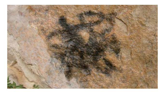
Figure 3 Horse Man Riding