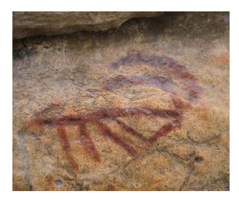
Figure 5 The Goat with Big Horn