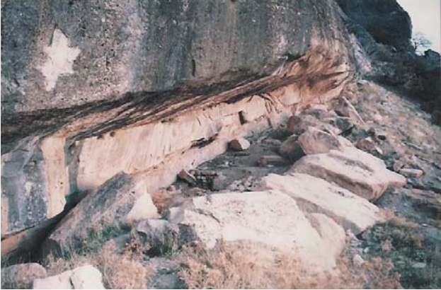
Figure 2 Eastern Wall Mir Malas