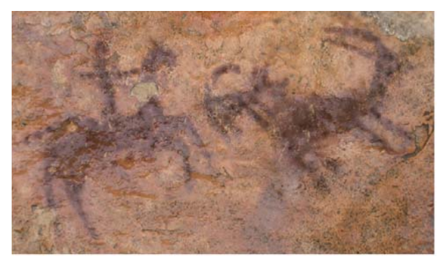
Figure 4 A Horse Man Riding to a Fawn and Hunting Dog