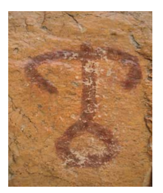
Figure 6 The Unknown Picture