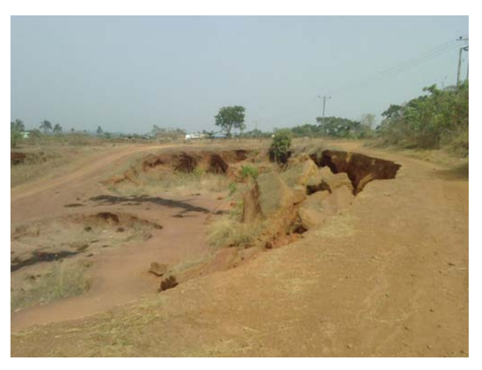
Plate 1: Erosion site in Anyigba, Nigeria

One serious consequence of soil erosion is that it leads to infertility and weakening of soil structure, which in turn; causes depletion of plant nutrients and loss of top soil layer. It can also cause severe damage to roads, irrigation canals and erected buildings and infrastructural facilities. Other impacts include exposure to direct insolation, leaching and general loss of soil nutrients.