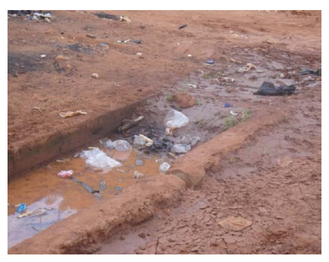
Plate 2: Blocked Drainage Along Old Egume Road

Another impact is that blocked drainage channels ooze out odours, which is offensive to human beings. This is aside the fact that they eventually amass into stagnant pools of water, which become unnecessary breeding grounds for mosquitoes, thereby causing malaria. Infact, it is dangerous for drainage channels to be blocked because it is a cause of accident for both pedestrians and okada riders that are not aware that it is a 'false ground'; and may end up falling into them.