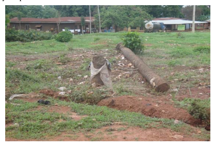
Plate 3: Cutting of Trees for Building Purpose

Deforestation can lead to soil erosion, reduction of soil cohesion, biodiversity loss and desertification. In extreme cases, landslides and even drought occur. Increase in global warming is another devastating impact of deforestation. In Anyigba, a noticeable impact is that daily temperature has increased.