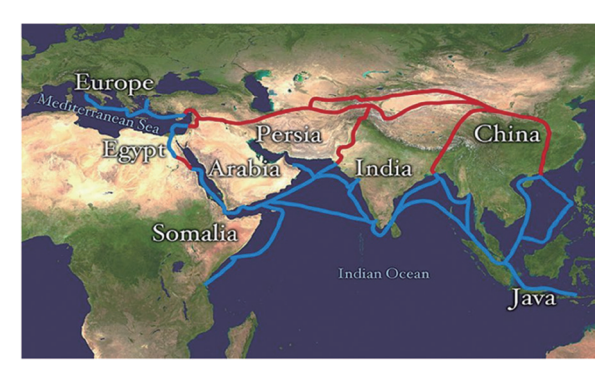
Figure 5 Gwadar Seaport; Source of Communication

Afghanistan is still in a state of war after the 9/11 incident and is passing through the process of nation building, and it is too soon to foresee how things settle down in the long run. Afghanistan lacks a systematic economy. The population depends on international aid and food support by the United Nations and other international agencies. But with the development of Gwadar, there are bright chances of economic boost in the adjoining areas of Afghanistan also as several states use Afghanistan as the route of transportation for imports and exports through the Gwadar Sea Port and resulting in the payment of a lot of taxes and road royalties to the Afghan government and helping in the stability of its economy (Baloch, 2010).