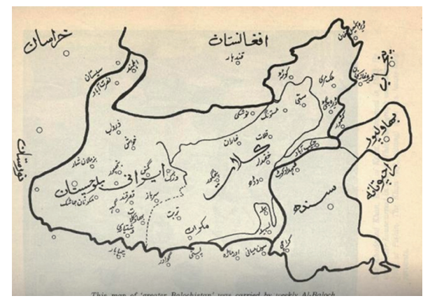
Figure 3 Map of Baluchistan Before Independence

of big powers, Baluchistan has great geo-political importance in the region of south Asia. To meet the challenges of the new order of the world, the big powers always use small powers to gain their national interests in the region. Placed near the close propinquity of buffer state Afghanistan, Baluchistan has become a region of great importance for regional and international powers to fulfill their ulterior objectives in the region. Its mineral resources, Gold, Copper, Iron, Sulphur and Marble attract the world powers towards Baluchistan to gain hegemony in this mineral rich region (Ahmad, 1989).