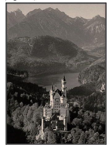
Figure 2 The Castle of Neuschwanstein