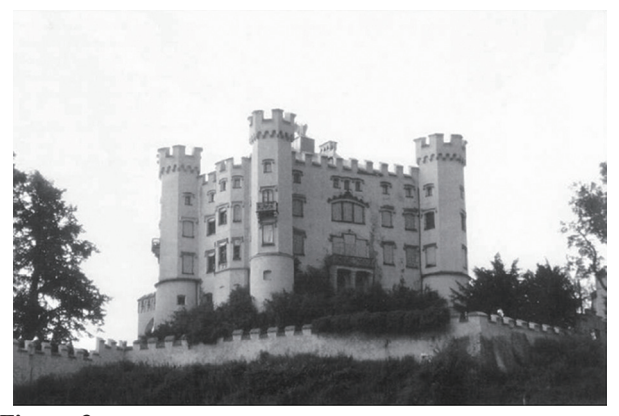
Figure 3 The Castle of Hohenschwangau

In 1832 Ludwig I's son, Maximilian, acquired the remains of the fortress of "Schwanstein", located above Lake Alpsee near the town of Füssen and first mentioned as the seat of the lords of Schwanstein in 1397. Hormayr, whom Crown Prince Max had consulted in the matter. supplied the castle with an illustrious history. In ancient times, he claimed, the fortress of Schwanstein had been in the possession of three German imperial families: The Wittelsbachs, the Stauffers and the Guelphs. It is true that the Guelphs and the Stauffers had had possessions in and around Füssen in the 11<sup>th</sup> to 13<sup>th</sup> centuries, but the fortress had not existed in those days yet. After glorifying its history, Hormayr also enhanced the castle's current status by comparing it with the castle of Wartburg located in Eisenach, calling them both national monuments (Arnold-Becker, 2011).