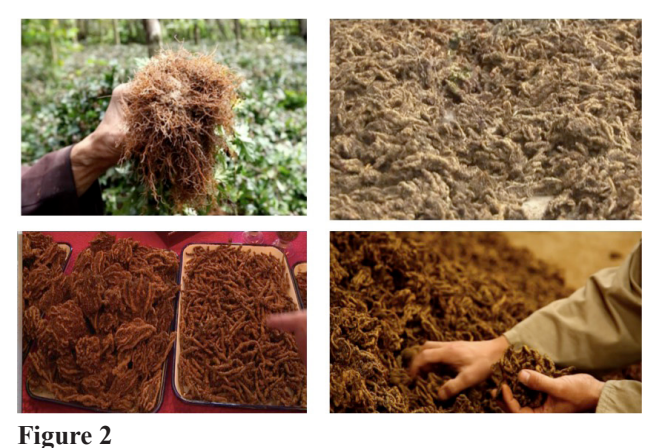
Rhizome of Coptis Figure 1: Coptis, the Plant

Coptis chinensis is indigenous plant in China, particularly those cool areas and edges of forests, which are primarily located in the provinces of mid and southwest China, including Hubei, Sichuan, Yunan and Chongqing. It grows best in damp boggy spots in woods with light, slightly acidic soils and much moisture.