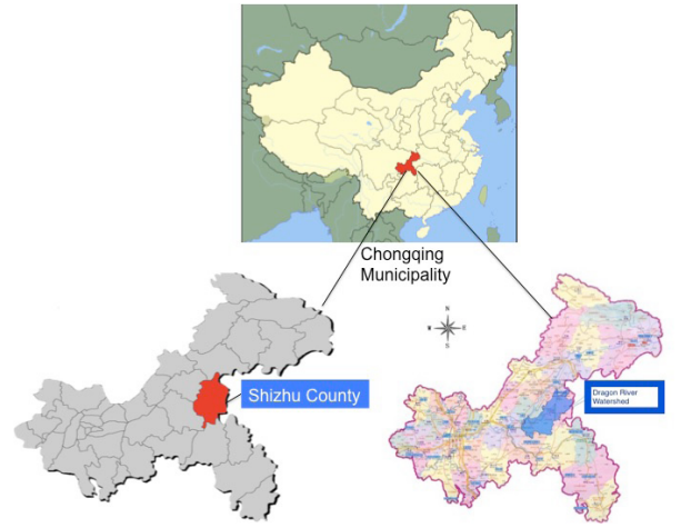
Figure 3 The location of the study site of Shizhu County in the Dragon River watershed in Chongqing Municipality

Shizhu County, officially named as Shizhu Tujia Autonomous County, is located in southeast Chongqing Municipality, China (Figure 3). It is south to the Yangtze River and in the center zone of three gorges reservoir region. Also, it is the only autonomous county for ethnic minorities in this region. Shizhu literally means "stone pillars", which is named after two big human-like natural stone pillars standing on Longevity Mountain, as described by the informants, which symbolises a Chinese version of "Romeo and Juliet", who objected to feudal oppression of freedom for love and died together tragically.