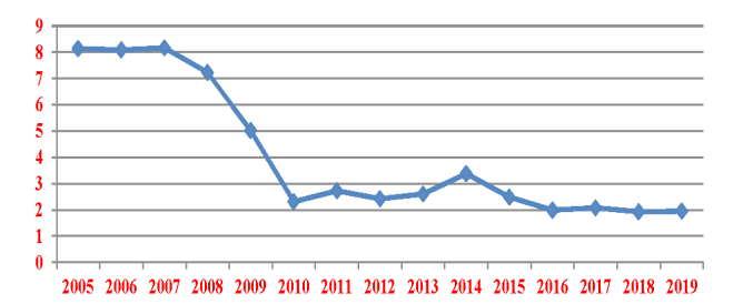
Figure 3 GDP Growth in Jordan 2005–2019