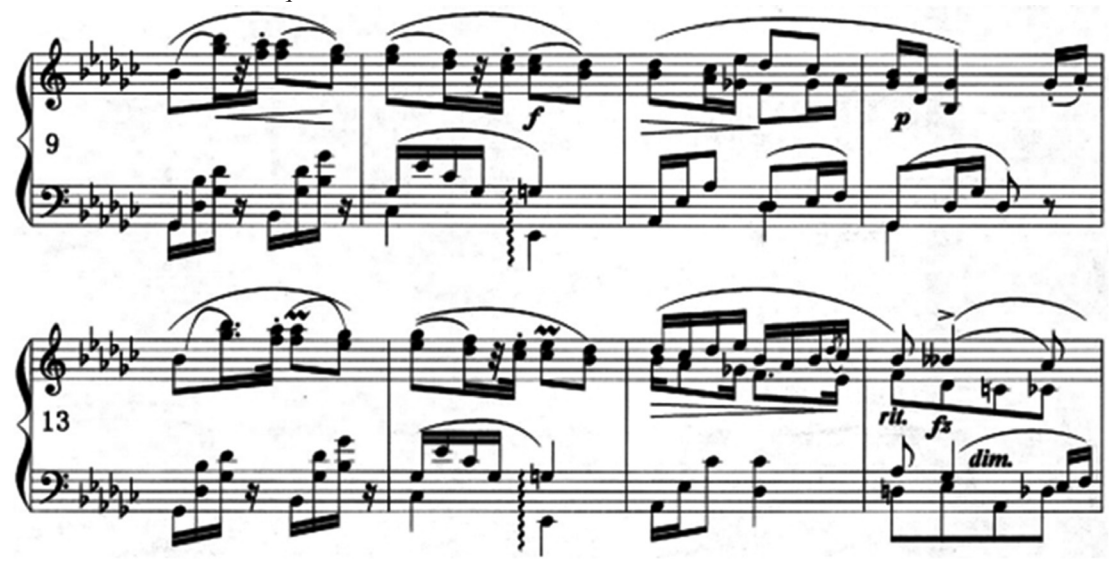
Notation 2: Dvorak's Humoresque Measures 9-16

Passage A repetition (Measures 17-24) is the simple repetition of Passage A with only a change in the end.