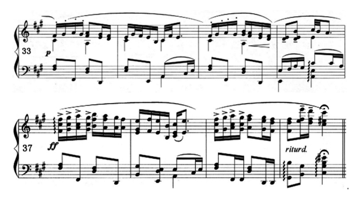
Notation 3: Dvorak's Humoresque Measures 33-40

development point of view, the former phrase ends in A major and the later phrase changes to "f minor in the 31st measure, open for the dominant chord. Passage C variation (measures 33-40) is the repeated variation of Passage C. The former phrase's bass changes from crotchet to quaver, and is superimposed with an octave parallel part; On this basis, the later phrase thickens the octaves (See Notation 3).