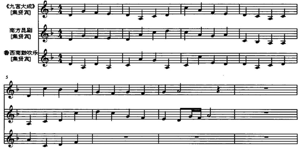
Opern 3 Tune Jixianbin Excerpt of Comprehensive Notation for Southern and Northern Ci-Poetry (Ma, 2012)

of the composers, the music tunes show corresponding diversity characteristics during the process of evolution from the vocal style to an instrumental style. As shown in Opern 3.