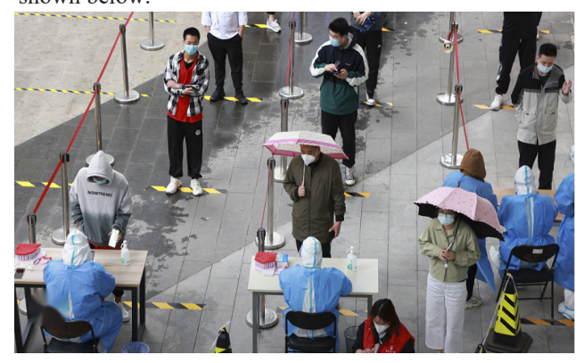
Figure 3 Nucleic acid tests

In the news image that represents the concept, there is no directionality, and there is no vector. The image only represents an objective existence of information. As shown below: