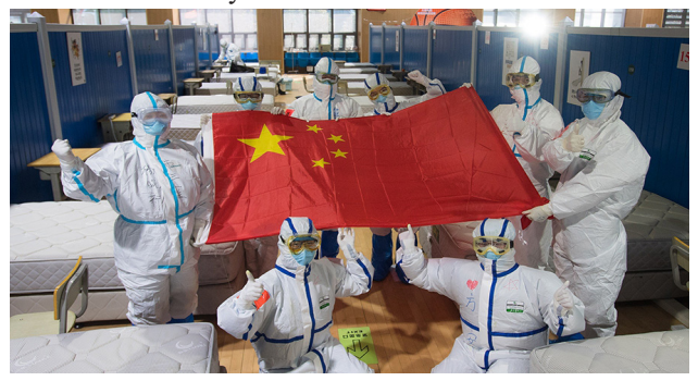
Figure 5 Encouragement

President Xi said that he was pleased to learn that they were receiving effective treatment and their condition was improving. The general secretary waved his greetings to the patients undergoing treatment. This reflects his concern for the people. This reflects the role of interactive function in news reporting. In the process of interactive function embodiment, we can divide the distance between image audience and image participants into close-up, short distance, medium distance and long distance. Generally, close-ups and close-up photos show the intimacy of the relationship. And the distance is medium or far away, which is generally used for alienating relationships. This close-up shows a close relationship and reflects the deep love of the party and state leaders for the people. From the point of view, the angle of shooting reflects an attitude. The shooting angle can generally be divided into up view, head up view and down view. The close-up lens in this picture uses a slightly upward view, which shows the people's love for the leader. This picture is to provide information directly.