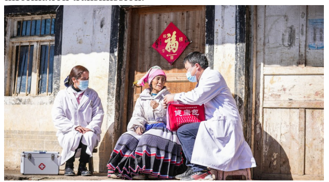
Figure 2 The distribution of drugs

concept reproduction. The vector is mostly represented by the lines formed by the eyes or attitudes and actions of the characters in the image and plays a great role in information transmission.