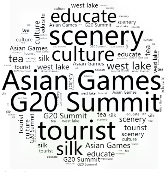
Figure 2 Entry search popularity word cloud

from Facebook and Twitter, the most popular overseas topics are scenic tourism and local cultural activities, and the percentage of the popularity of scenic tourism entries is 35.14 % (Facebook), 22.62% (Twitter). The lowest level of discussion is in science, technology and economics. The percentages of technology entries are 0.86 % (Facebook), and 1.19% (Twitter), and the percentages of economy articles: are 1.36 % (Facebook), and 2.38% (Twitter) (Liu and He, 2015). Since 2010, the most represented international events in Hangzhou have been the China Hangzhou West Lake International Expo, the G20 Summit, the 14th West Lake International SME Symposium, and the 2022 Hangzhou Asian Games. Some of them are international hotspots in economics and technology. International netizens lack interest in this aspect of Hangzhou, and Hangzhou's international public opinion is relatively low.